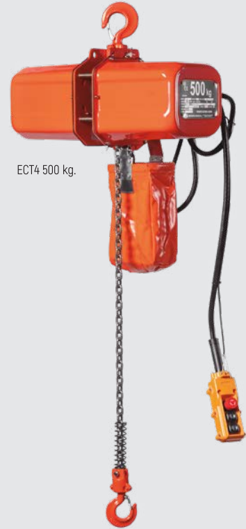
ECT4 500 kg.