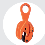
SIMPLE POSITION CLAMPS B MODEL Pag. 51