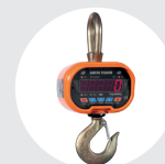
CRANE SCALES GPJ MODEL Pag. 79