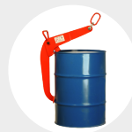
CLAMPS FOR DRUMS PBID MODEL Pag. 58