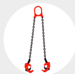
CLAWS FOR DRUMS GABID MODEL Pag. 60