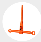
EYEBOLT RATCHET TENSIONER ATC MODEL Pag. 98