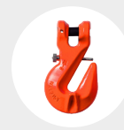
SHORT HOOK WITH DIRECT CONNECTION LATCH G.80 MODEL Pag. 81