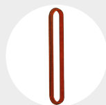
ROUND SLINGS Pag. 95