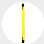
WEBBING SLINGS Pag. 94