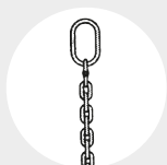
SLING "SO" Pag. 84