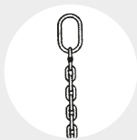
SLING "SO" Pag. 84