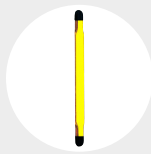
WEBBING SLINGS Pag. 94