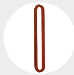
ROUND SLINGS Pag. 95