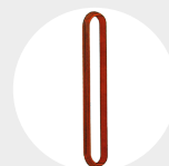
ROUND SLINGS Pag. 95