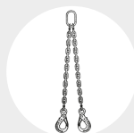
SLING "DOL" Pag. 84