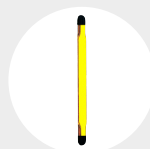
WEBBING SLINGS Pag. 94