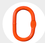
OVAL RING Pag. 78