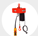
SINGLE PHASE ELCTRIC CHAIN HOISTS COMPACT MODEL Pag. 125