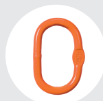
MASTER LINK Pag. 78