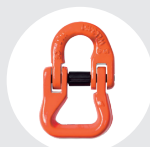
POLYESTER CONNECTOR Pag. 79