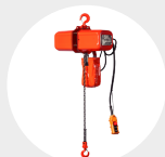
CHAIN HOIST COMPACT MODEL Pag. 116