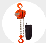
MANUAL CHAIN HOISTS SERIES 630 Pag. 20