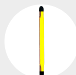
WEBBING SLINGS Pag. 94