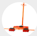
ROLLER SKATES TROLLEYS ATACA MODEL Pag. 68