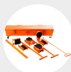
TROLLEY KITS AKT MODEL Pag. 69