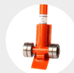
LIFTING LEVER APAEL MODEL Pag. 70