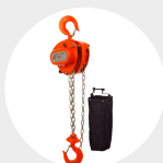
HAND CHAIN HOISTS SERIES 630 Pag. 116