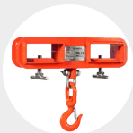
FORKLIFT HOOK UCAR MODEL Pag. 75