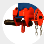
TYPE A TROLLEY 500 SERIES Pag. 22