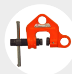
SPINDLE CLAW WF MODEL Pag. 49