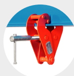
ANCHOR CLAMPS BC MODEL Pag. 25