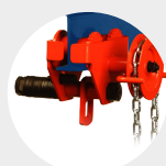
TYPE A TROLLEY 500 SERIES Pag. 22