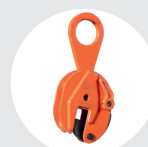
FIXED CLAWS B MODEL Pag. 47