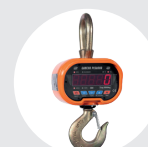
WEIGHING HOOK GPJ MODEL Pag. 73