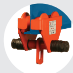
TYPE B TROLLEY SERIES 500 Pag. 47