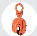
MULTIPOSITION CLAMPS BT MODEL Pag. 46