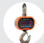
CRANE SCALES GPJ MODEL Pag. 73