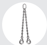
SLING "DOL" Pag. 84