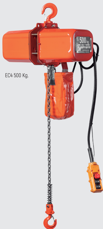
EC4 500 Kg.