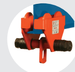
TYPE B TROLLEY SERIES 500 Pag. 22