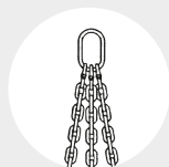
SLING "TO" Pag. 85