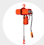
THREE-PHASE CHAIN EC4 MODEL Pag. 116