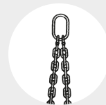
SLING "DO" Pag. 84