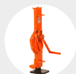
RACK JACK MODEL GC Pag. 66