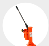
HYDRAULIC TOE JACK MODEL AGATU Pag. 67