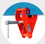
BEAM CLAMPS MODEL BC Pag. 25