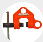
SCREW CLAMPS MODEL WC Pag. 49