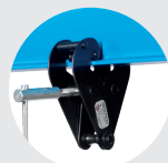
BEAM CLAMP FOR SHOWS BCA MODEL Pag. 123