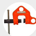
SCREW CLAMPS MODEL WC Pag. 49