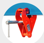
BEAM CLAMPS MODEL BC Pag. 25