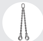
SLING "DOL" Pag. 80