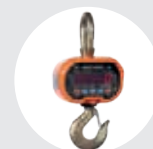
CRANE SCALES GPJ MODEL Pag. 70