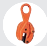
SIMPLE POSITION CLAMPS B MODEL Pag. 37