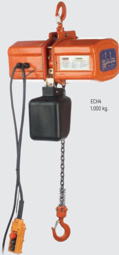
ECH4 1.000 kg.