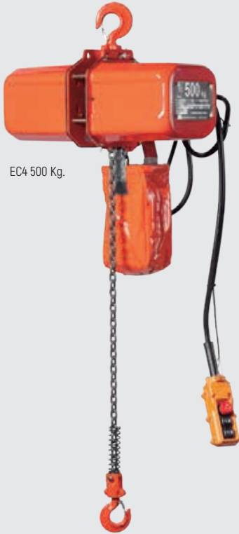
EC4 500 Kg.