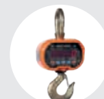
CRANE SCALES GPJ MODEL Pag. 70