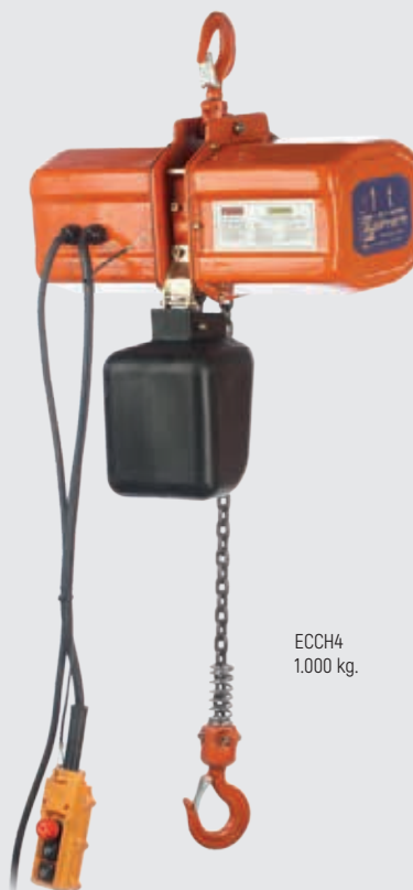
ECCH4 1.000 kg.