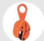
SIMPLE POSITION CLAMPS B MODEL Pag. 37