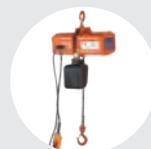
ELECTRIC CHAIN HOISTS ECH4 MODEL Pag. 110