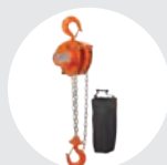
HAND CHAIN HOISTS SERIES 630 Pag. 20