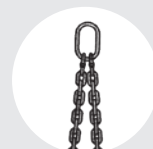
SLING "DO" Pag. 80