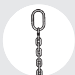
SLING "SO" Pag. 80