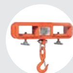
FORKLIFT HOOK UCAR MODEL Pag. 56