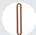
ROUND SLINGS Pag. 91