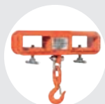
FORKLIFT HOOK UCAR MODEL Pag. 56