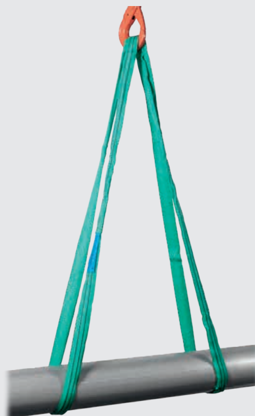
CARGA MÁXIMA DE UTILIZACIÓN (C.M.U.) KGS.