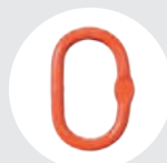
MASTERLINK Pag. 74