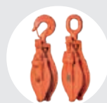
SNATCH BLOCKS PBG/PBC MODEL