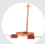
ROLLERSKATES TROLLEYS ATACA MODEL Pag. 65