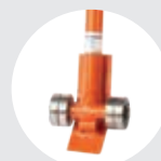
LIFTING LEVER APAEL MODEL Pag. 67