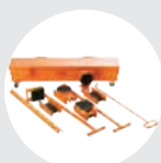
TROLLEY KITS AKT MODEL Pag. 66