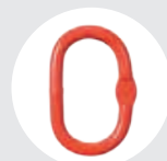
OVAL RING Pag. 74