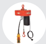
SINGLE PHASE ELCTRIC CHAIN HOISTS COMPACT MODEL Pag. 117