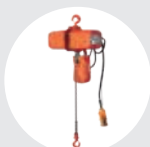
ONE SPEED ELECTRIC CHAIN HOISTS EC4 MODEL Pag. 106